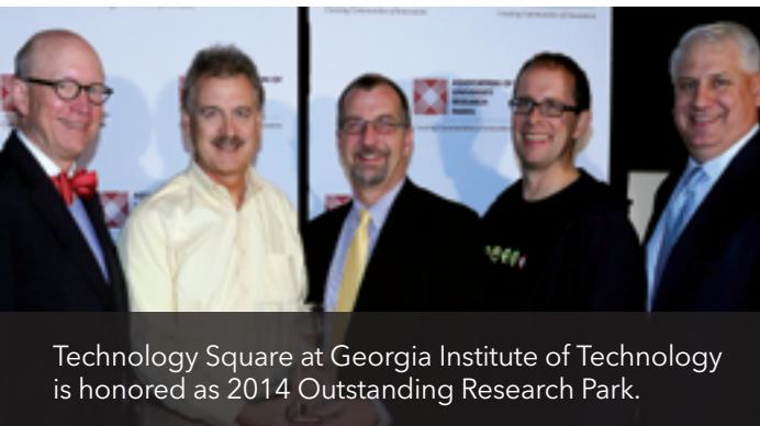
Technology Square at Georgia Institute of Technology is honored as 2014 Outstanding Research Park.